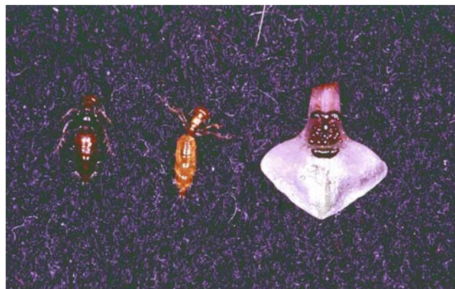
Fig. 2 Comparison of model and mimic in an Australian sexually deceptive pollination system. Two females of Neozeleboria cryptoides are shown with a labellum of a Chiloglottis trapeziformis flower. The size of the flower and its 100 times larger production of the attractive odor compound suggest that it represents a supernormal stimulus for males (Schiestl 2004)

in the pollinators (Faegri and van der Pijl 1979; Vogel 1983). Deceptive plants face the challenge of repeatedly attracting pollinators that often rapidly learn and avoid non-rewarding plants (Ackerman 1986; Ayasse et al. 2000). To do so, these plants imitate signals attractive to pollinators, a phenomenon called floral mimicry. Two types of mimicry are generally recognized among deceptive flowers. The first is Batesian mimicry in a strict sense, consisting of a “mimic” that imitates signals of a “model”, and an “operator” that responds to them (Fig. 2; Wickler 1968; Wiens 1978; Dafni and Ivri 1981; Dafni 1984; Dafni 1987). Alternatively, a model species may not exist, but plants mimic general floral signals such as bright colors and floral scent, a phenomenon termed generalized-, or non-model mimicry (Nilsson 1983; Nilsson 1992). This discrimination between two types of mimicry is important as it predicts different evolutionary outcomes (Dafni 1983; Nilsson 1992). In Batesian mimicry, the reproductive success of a mimic depends on its frequency relative to the model and the capabilities of the operator to discriminate between