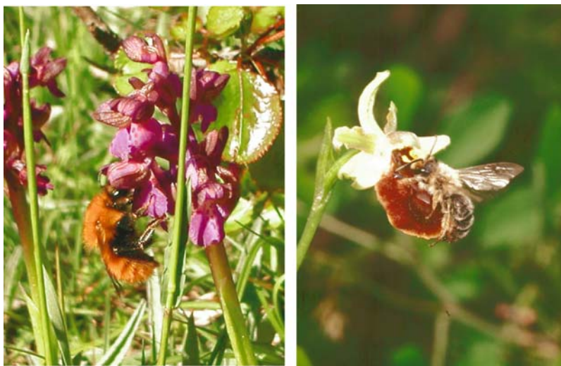
Fig. 1 Contrasting the two deceptive pollination systems food deception and sexual deception. a Anacamptis morio with one of its pollinators, Bombus pascuorum in southern Italy. b A flower of the sexually deceptive Ophrys sphegodes with its pollinator, a male of the solitary bee Andrena nigroaenea . The male carries pollinaria of this orchid on its head

imitate mating signals of certain insect species and are pollinated by sexually aroused males, that mistake the flower for a female and pollinate it during a “pseudocopulation” (Fig. 1). Like food deception, sexual deception has also evolved multiple times being represented by the European genus Ophrys , South African Disa and nine Australian genera, altogether comprising about 400 described species (Dafni and Bernhardt 1990; Steiner et al. 1994; Pridgeon et al. 1997). However, this pollination syndrome is probably more widespread as currently known, because new cases have been described recently in some genera of neotropical Maxillariinae, and Pleurothallidinae (Singer 2002; Singer et al. 2004; Blanco and Barboza 2005). Among the latter group, sexual deception may be prevalent in the large genus Lepanthes (>800 species; Blanco and Barboza 2005). Additionally, anecdotic evidence exists for other orchid genera (van der Pijl and Dodson 1966; Yadav 1995) and even one case outside the orchid family has been proposed (Rudall et al. 2002). Sexual deception differs from food deception by the exclusive attraction of male insect pollinators that have the motivation of mating rather than searching for food. Accordingly, pollination is often species-specific and floral odor, a mimicry of the pollinators sex pheromone, is crucial for pollinator attraction (Paulus and Gack 1990; Borg-Karls 1990; Bower 1996; Schiestl et al. 1999).